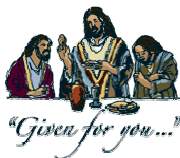
"Given for you..."

Palms will be handed out Senior and Junior Choirs