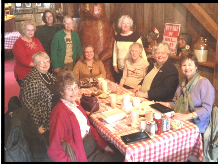
Most recent trip to Parker's Maple Barn for lunch.

Some of the ladies of our church get together for lunch the first Friday of each month. It's a fun time and all are welcome to join them anytime!