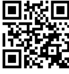
Join Our Email List