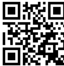
Join Our Email List