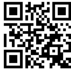
Join Our Email List