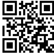
Join Our Email List